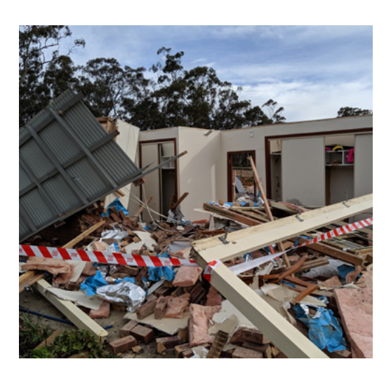
Damage caused by the tornado in Axe Creek, Victoria (12 km southeast Bendigo), 29 June 2019.