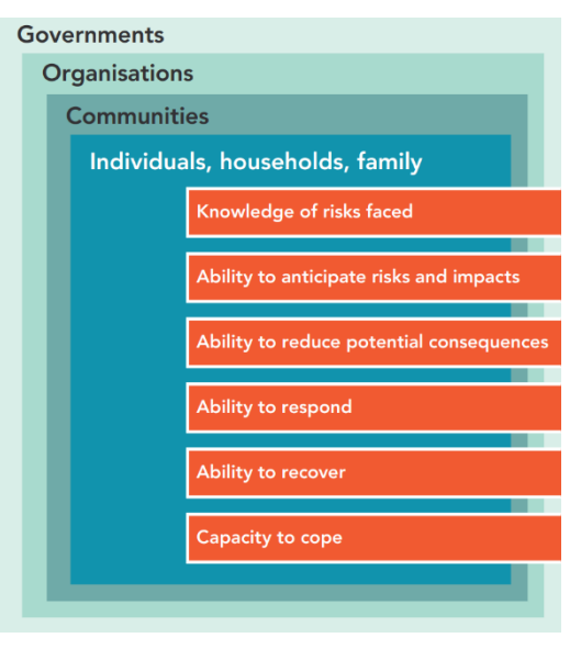
Figure 2: Features that effect the level of vulnerability and resilience

Please do not feel your submission needs to be constrained to the questions posed; you may wish to address the issues and questions below directly, or use these as a guiding prompt for additional ideas and consideration.