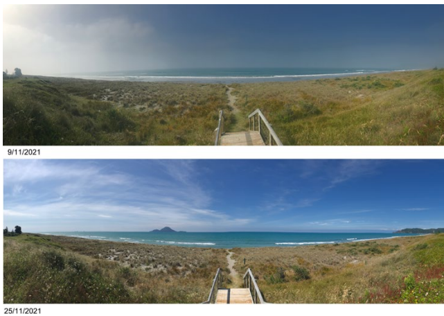
Figure 2: Top image: view north from Coastlands Beach on 9 November showing effects of vog on visibility. Lower image: typical view from same location. Moutuhorā/Whale Island is visible in the lower photo and is approximately 8 km away, The Whakatāne headland, also visible in lower photo, is approximately 3.5 km away.