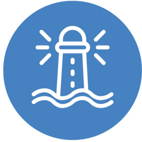
A sense of safety