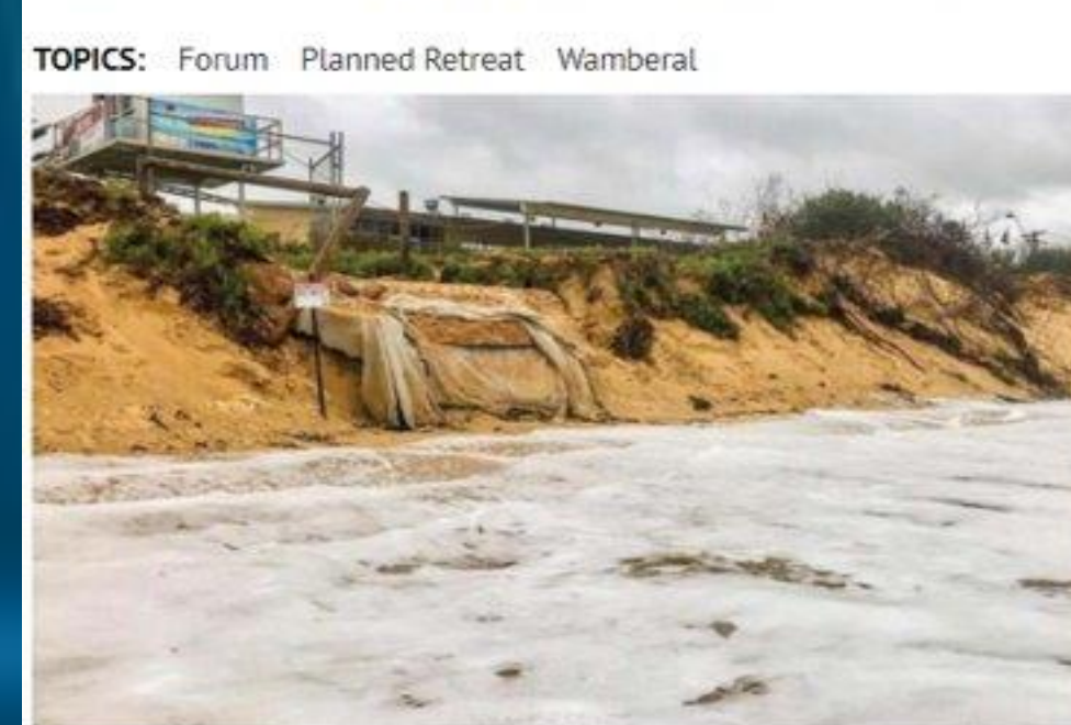
OCTOBER 16, 2020 https://coastcommunitynews.com.au/central-coast/news/2020