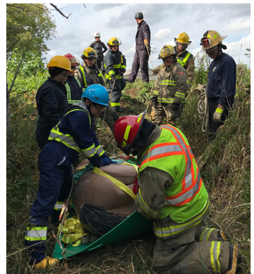
Large animal rescue training for responders.

The programs are at: www.thehorseportal.ca/partner/first-responders and www.farmfoodcareon.org/emergency-training .