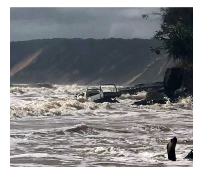
Figure 2: Wave setup resulting in beach inundation and vehicle damage at Rainbow Beach, north of the Sunshine Coast.