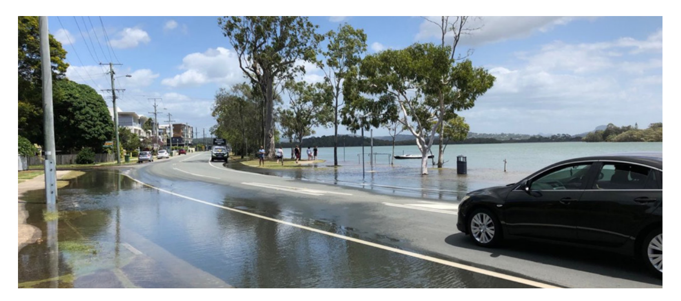
Figure 3: Minor river flooding in Maroochydore, Sunshine Coast associated with high spring tides and the storm surge component from Cyclone Oma.