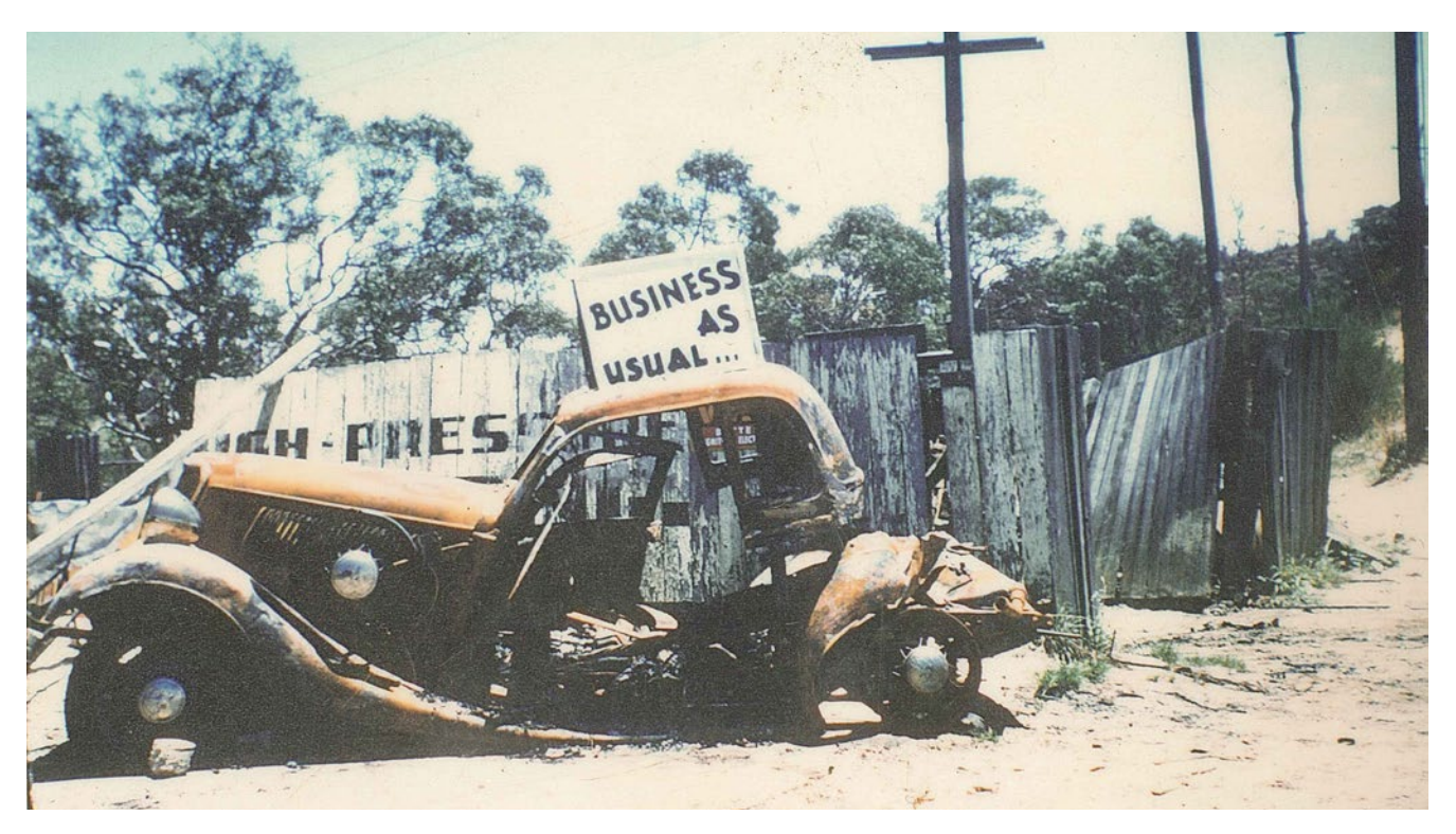
A burned-out wreck at the Wentworth Falls service station after fires in 1957.

eyewitness accounts, in the lead-up to and coinciding with the film screenings. To date, another 12,000 people have viewed the film on YouTube or DVD.<sup>2</sup>