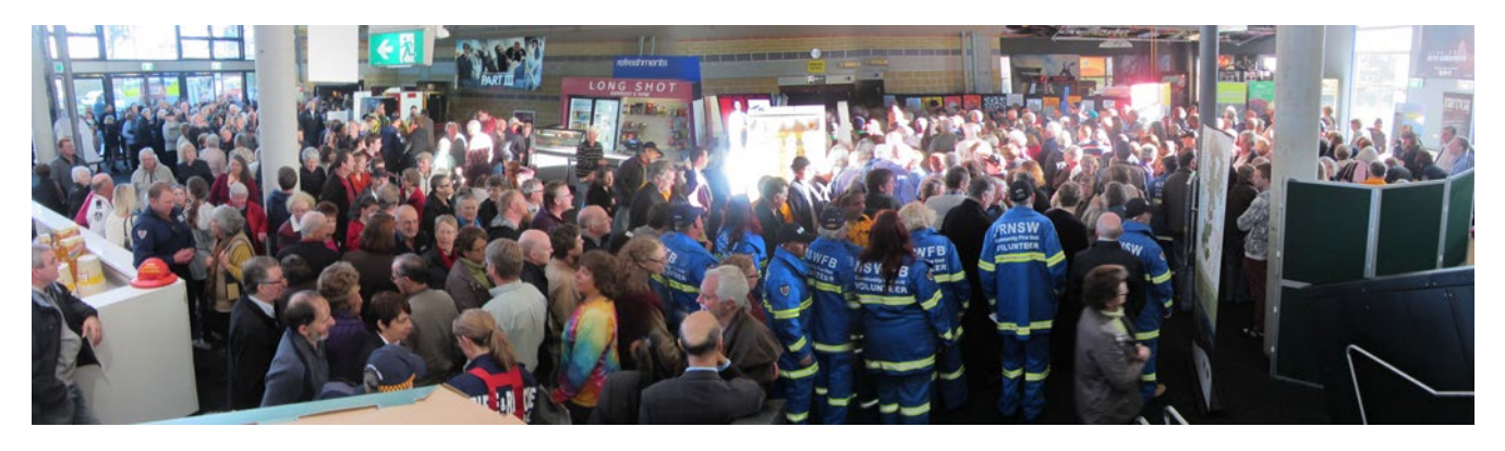
Fire Stories screening in June 2013.