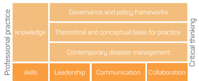
Figure 2: Domains of the Generic Emergency and Disaster Management Standards.

The GEDMS have been organised around the required knowledge and skills needed to practice. The three main themes within the knowledge domain are governance and policy frameworks, theoretical and conceptual basis for practice and contemporary disaster management. The three themes that emerged within the skills domain were leadership, communication and collaboration. The two themes that emerged from the application domain were professional practice and critical thinking. These are represented in Figure 2.