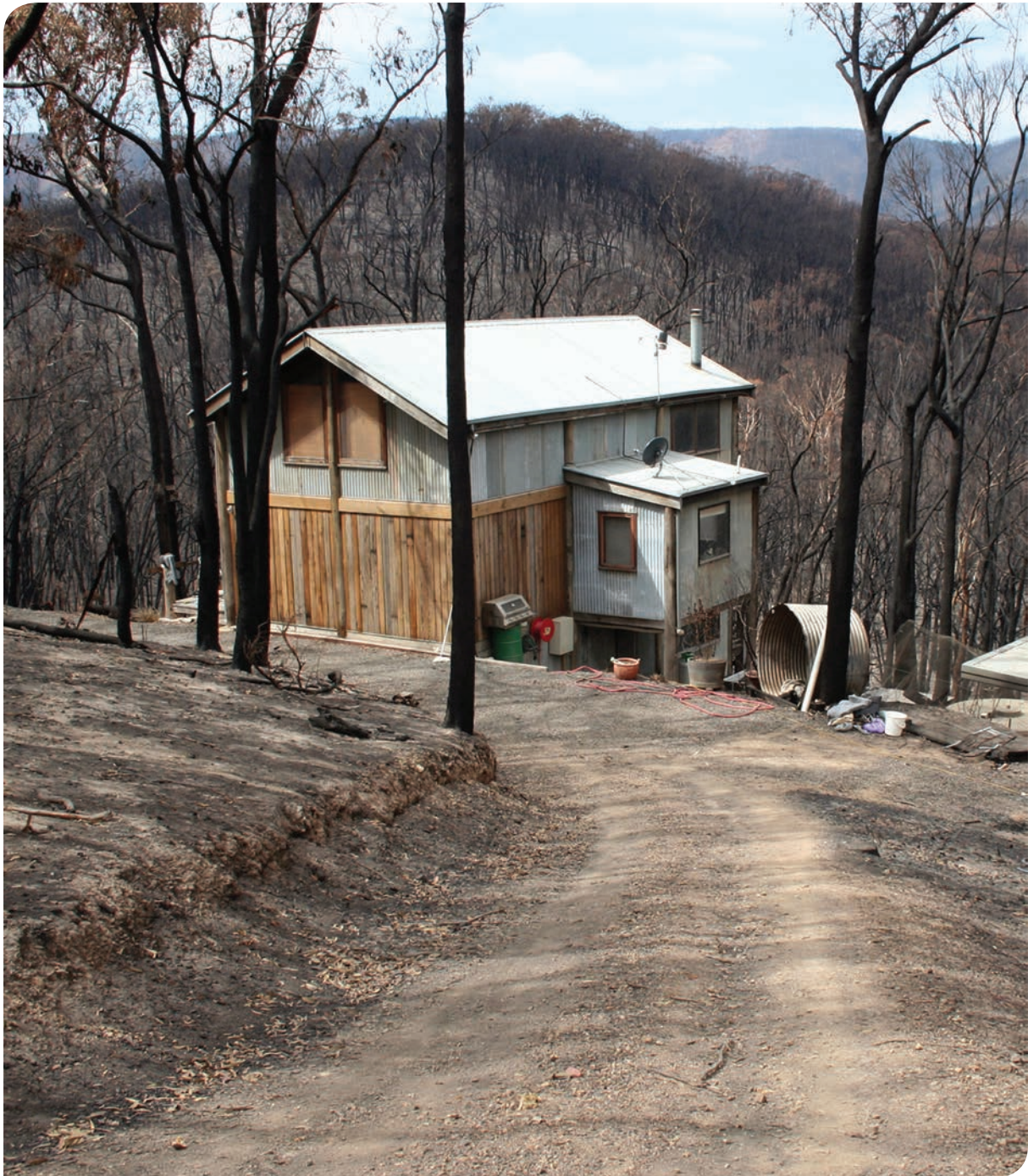
House at Strathewen, Victoria, that was successfully defended in the February 2009 Black Saturday fires.

A subset of forest plant communities in which the trees form only an open canopy (between 20 per cent and 50 per cent crown cover), the intervening area being occupied by lower vegetation, usually grass or scrub.