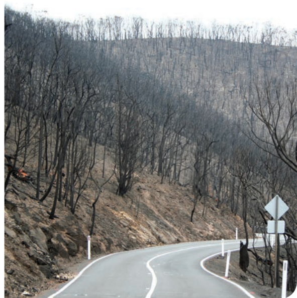
Kinglake Road, Victoria, one week after the February 2009 Black Saturday fires.

'...appropriate use of planned fire to protect communities and their assets, and to protect and conserve natural and cultural values.'