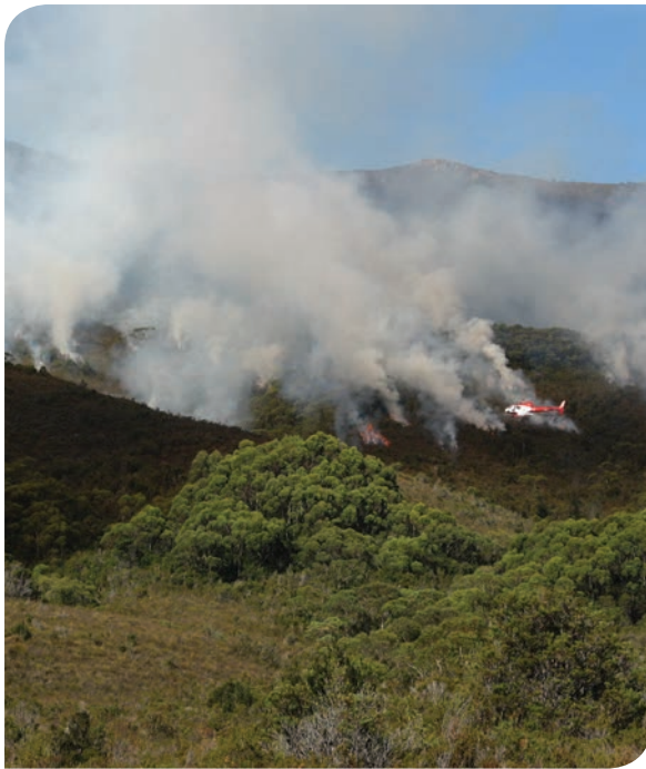
2011 fuel reduction burn at Red Tape Creek, Tas, using aerial incendiaries.