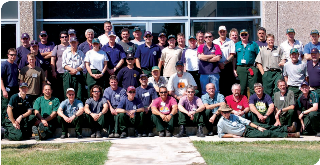
International deployment of Australian/New Zealand fire fighters to the United States of America – Boise, Idaho, August 2006 (photo: Parks Victoria).