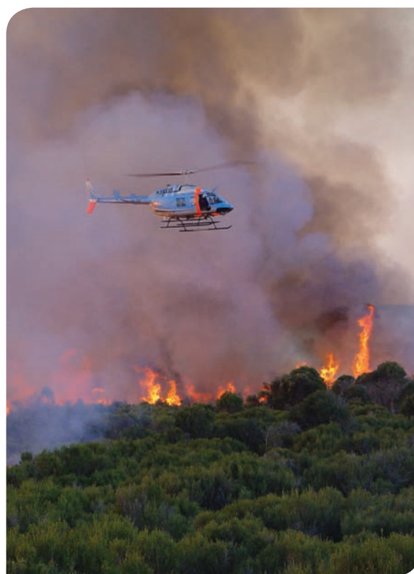
Planned fire in coastal forests using aerial incendiary operations in South Australia, 2001 (photo: Chantelle O'Brien, Department of Environment, Water and Natural Resources, South Australia).

Australia plays a significant role within the international bushfire management community. Our achievements in fire research, bushfire mitigation and management, and community involvement, are increasingly influencing approaches to bushfire management worldwide. A clear vision and policy, aimed at improving the management of fire by land and bushfire management agencies and communities, will consolidate this international contribution.