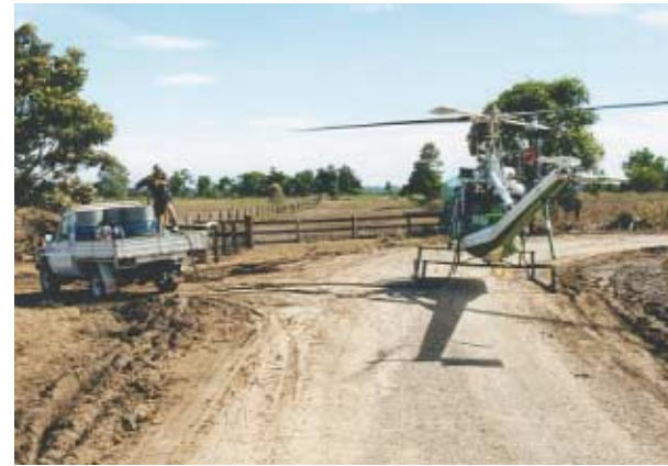
In special cases airplanes and helicopters can be used as part of the warning process.

Subsequent sections of this paper explain how the above observations were used by the consultants and the SES in a series of workshops to arrive at a preferred warning system for the Hawkesbury-Nepean Valley.