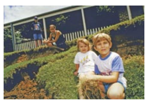
Having good foundations to your house and ensuring that the house is secured to its foundations can minimise the risk to a house

Earthquake Anxiety (2) acts to reduce the likelihood that people will begin the preparedness process. That is, it