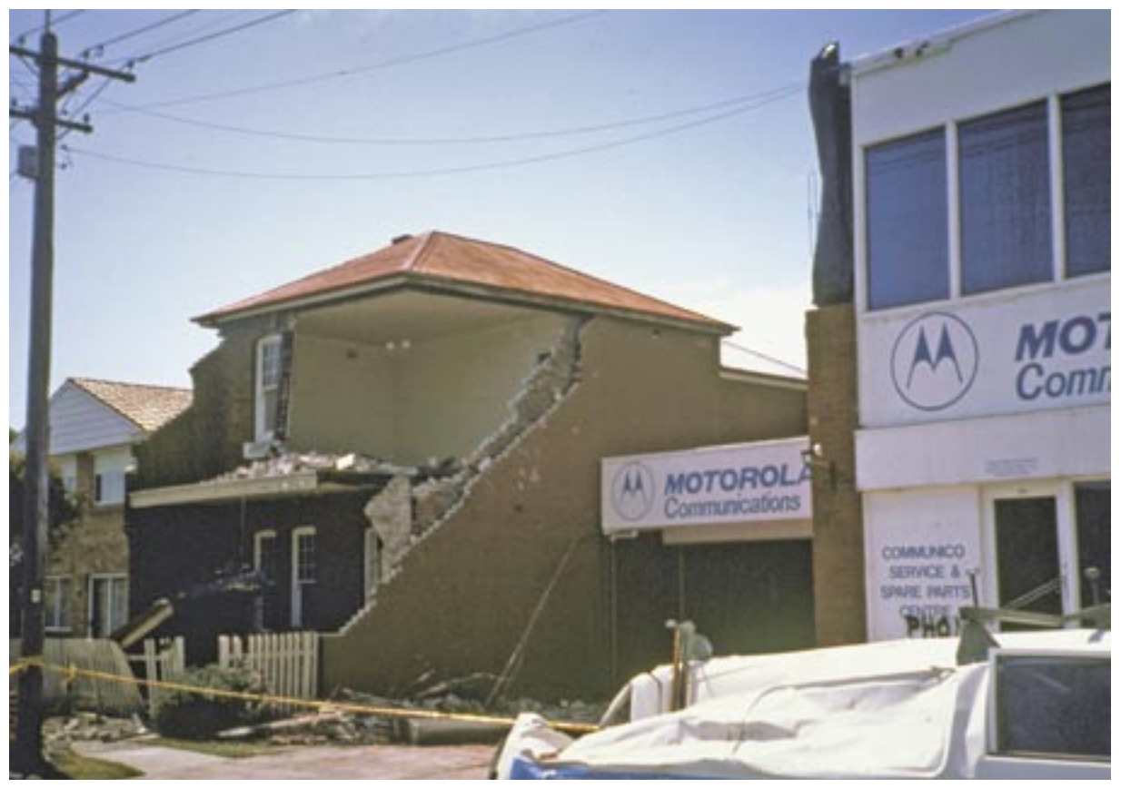
While the house at the centre of the photograph has been damaged, those around it have remained relatively intact. Differences in quality of construction or maintenance can help explain the uneven distribution of damage. This highlights the importance of including building checks and regular maintenance in an earthquake preparedness plan and rectifying any problems to minimise damage