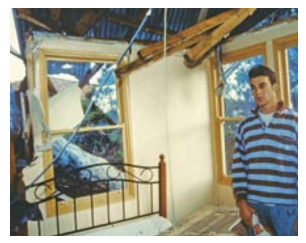
The risk of damage to a house and injury to its inhabitants can be minimised by securing the roof and internal fixtures such as high bookcases and mirrors

Current approaches to promoting preparedness assume it exists on a scale from low to high levels, and that any intervention will result in a movement towards greater preparedness. The present study casts doubt on these assumptions. Firstly, it is important to acknowledge that some people may be inhibited from engaging in the process in the first place. In this study, earthquake anxiety (2) was implicated in this regard. Secondly, the existence of two discrete processes that hold different relationships with preparedness suggests that one set of strategies is required to facilitate