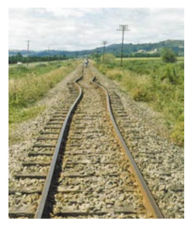
Travel disruptions and freight transport can be disrupted by rail lines buckled by earthquake