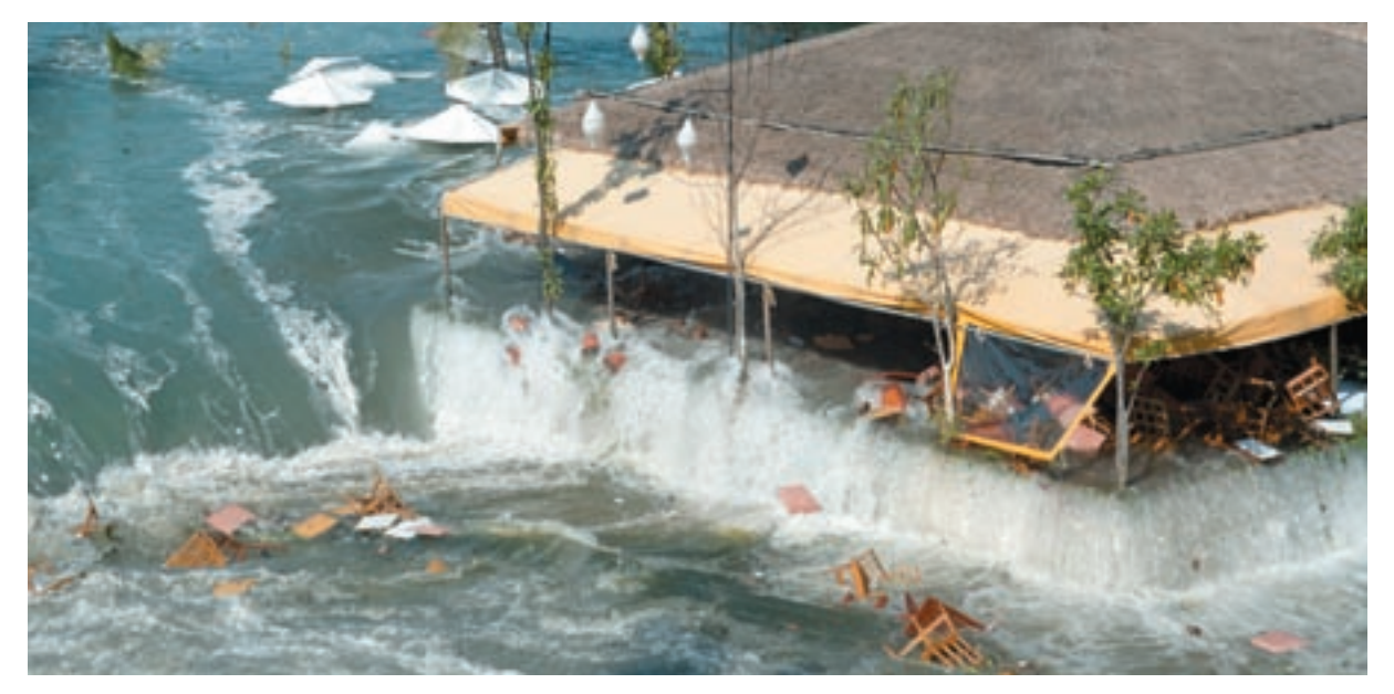
Tsunamis occur in many geographic regions all over the world.

The high percentage (62 per cent) of the council officers (compared with 35 per cent of the public) who indicated that 'death and injury of people' were likely to be the greatest impact of a tsunami in Sydney may reflect their respective professional responsibilities (or liability). Similar findings were made by Dominey-Howes and Minos-Minopoulos (2004). This suggests that future risk mitigation strategies might need to include some focus on the potential effects of tsunami on human life. Such a focus will help to increase the effectiveness of the risk mitigation message since the public may be more receptive to such a message.