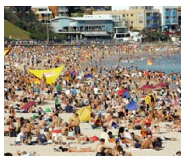
Bondi Beach, Australia vulnerable to the effect of Tsunami inundation?

Emergency Management Australia (EMA) is working with State and Territory emergency management officers to effect tsunami preparedness through programmes of awareness raising and community capacity building including training, exercises and planning (Sullivan, 2006). EMA aims to engage the community by assisting them to learn to recognise the signs of approaching tsunami, thus increasing their inherent level of awareness and also tailor and focus awareness raising