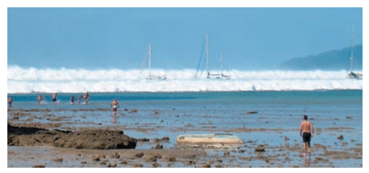
Tsunamis can have devastating effects on communities.

Knowledge of the tsunami warning system operating for the Pacific (and Sydney region) was very limited. Astonishingly, only 8 per cent of the council officers knew about the tsunami warning system whereas, 29 per cent of the public did. Surprisingly, some participants believed that Sydney does not need such a system even though most participants believed Sydney is at risk.