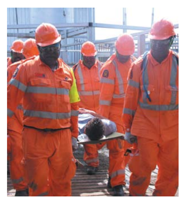
The aim of the strategy is to improve community safety in remote indigenous communities.

The National Emergency Management Strategy for Remote Indigenous Communities: 'Keeping Our Mob Safe' is accessible on the EMA website at www.ema.gov.au.