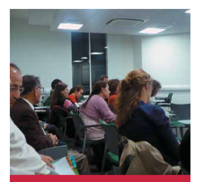
Narrative interviews were used to explore complexities and processes and focus groups were used to validate findings.

For the purpose of this research a narrative approach was considered most appropriate, as this would provide access to the salient views, values and reality of living in seasonally threatened bushfire community. Further to this, the study used two different techniques in order to obtain a rich and full understanding of the experience of living in a bushfire community. Narrative interviews were used in order to understand the complexities and processes that emphasised the community members' experience (Mishler, 1991), and a focus group was used to validate the findings that emerged from the interviews with regard to what factors are important in living in a seasonally threatened community.