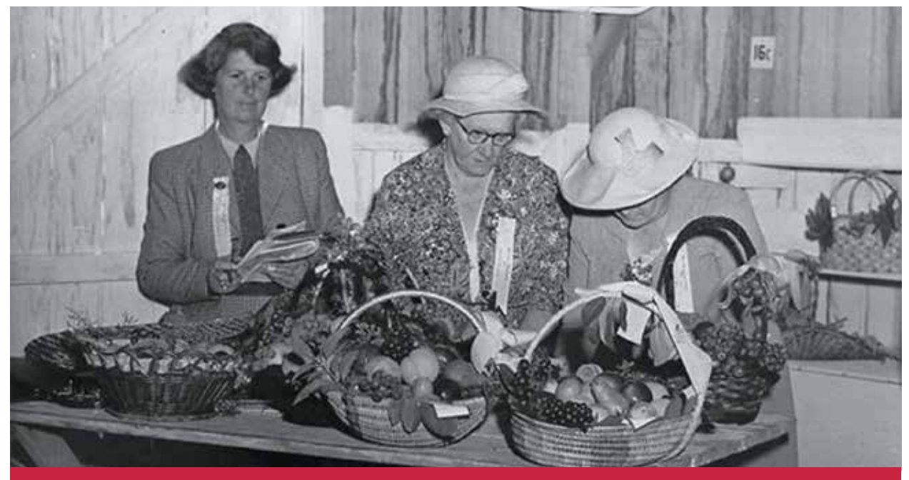
Women have very important roles in our community and are key players in community mobilization in pre and post-disaster activities.

The themes that emerged suggest that it is a combination of factors that are relevant to a disaster experience at the individual level and the community level. The factors identified (self-efficacy, coping style, social networks, sense of community and community competence) presented a more comprehensive picture of the possible variables that may mediate the disaster experience. It is therefore the interplay of these factors that are important to the experience of a community facing a natural seasonal disaster. Further to this is the relationship between, and the combination of, community competence and sense of community. Kulig (2000) refers to the combination of these variables as community resilience (see Pooley, Cohen & O'Connor, 2006). Therefore one of the conclusions from this study results is that by increasing the competence of the community and the attachment residents have for the community you may be targeting and effecting community resilience.