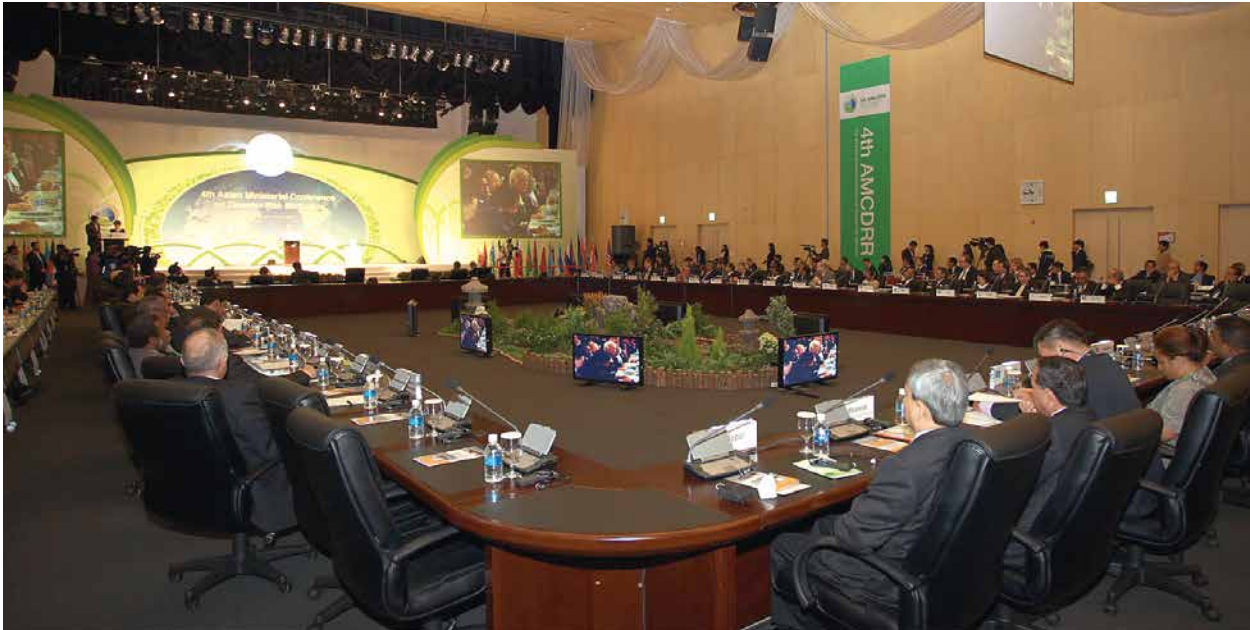
The AMCDRR, Incheon, October 2010.

international education and training activities for government and non-government agencies from Asia and the Pacific region.