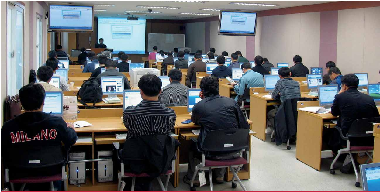
A classroom in the NDMS Information Centre.

NDMI runs. As with the teaching rooms in the main building, each room is well equipped and appealing to those who want to learn, with a large whiteboard for brainstorming ideas, a computer terminal and a conference style table to facilitate group working and the preparation of presentations. This style of learning is encouraged by NDMI to allow trainees to demonstrate and consolidate what they have learned, and often an element of competition is introduced to the group work portion of the classes to encourage high standards.