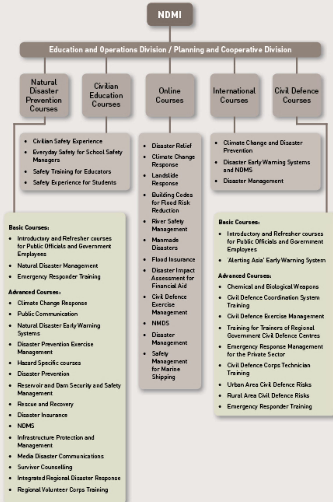
Figure 2. A selection of the courses offered by NDMI.