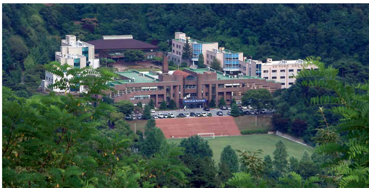
The NDMI and National Fire Service Academy campus.

The NDMS building also houses eight discussion rooms designed specifically for group work exercises, which form an essential component of all of the courses that