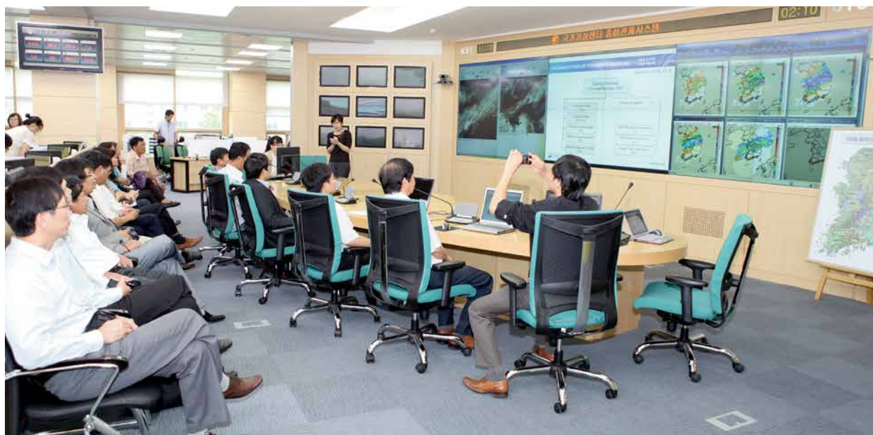
Visiting the Meteorological Office.

can be assessed for quality and revised where necessary.