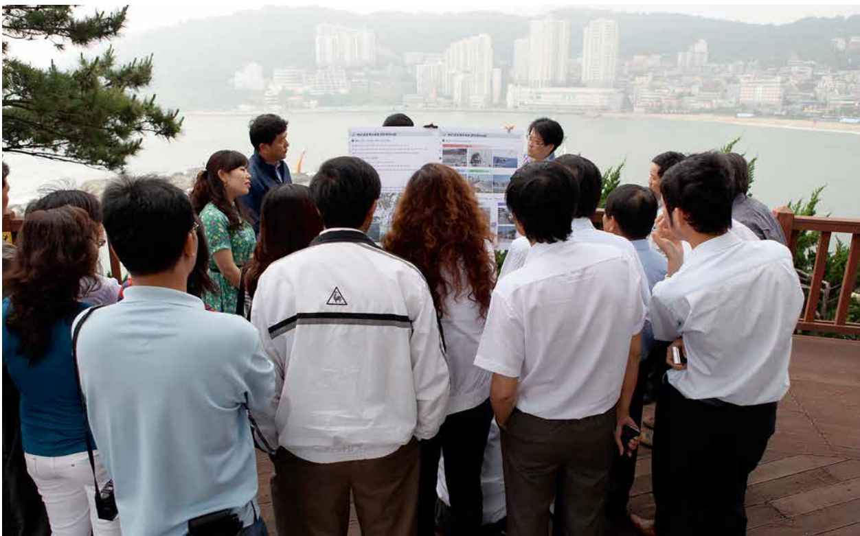
The Vietnamese delegation on a field trip.

As may be expected, quality control is also viewed as very important. Course material and trainee feedback are assessed annually by the Education and Operations Division and the resident professors so that courses