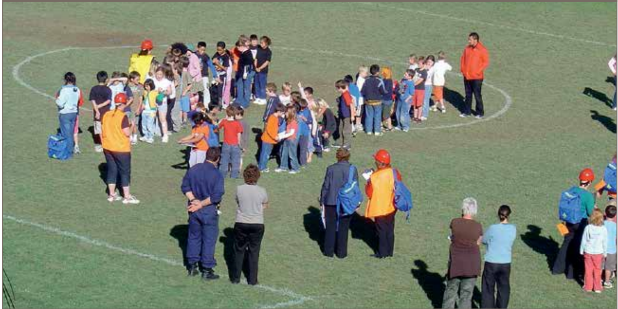
FIGURE 3. Children and teachers assembling on the school field as part of the 2007 drill.