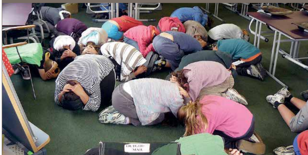
FIGURE 2. Children of Ridgway School, Wellington, taking part in their annual earthquake drill

Once the all clear had been given by the class teachers, children immediately left the classrooms by the designated emergency exit doors, and moved away from the buildings in an orderly manner. Teachers were last to leave the classrooms after all their pupils had left (followed by the observers). Teachers then joined their class-groups, and instructed the pupils to move together to a pre-identified area which was a safe distance from the classroom. At this point, teachers checked their class rolls to ensure all children were accounted for. Teachers then moved with their classes to the school's designated assembly area, a large asphalt area a safe distance away from all school-buildings. At the assembly point, the principal accounted for all classes.