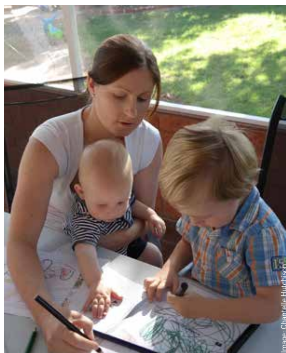
Talking and sharing experiences include playing games and using other ways to express thoughts and feelings.