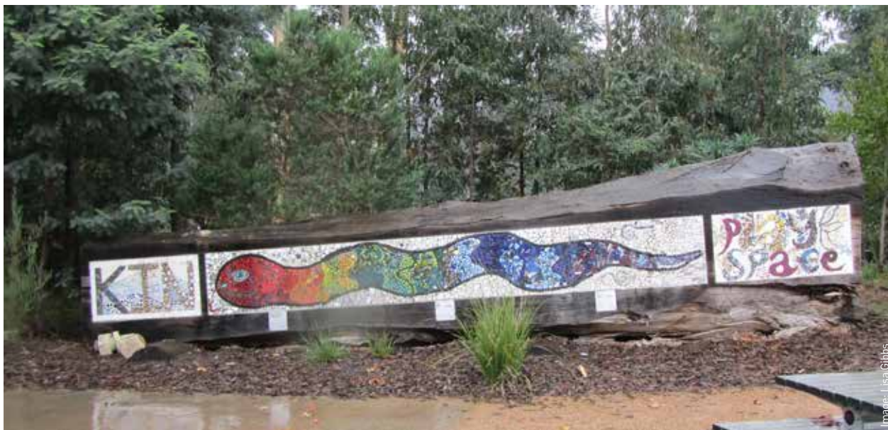
This mosaic is a feature of 'Kin Play-space' in the township of Marysville, Vic, which was devastated by the Black Saturday bushfires in 2009. The Kin Play-space is on the site of the former kindergarten and provides a place of quiet reflection and the extension of exploratory play for children.