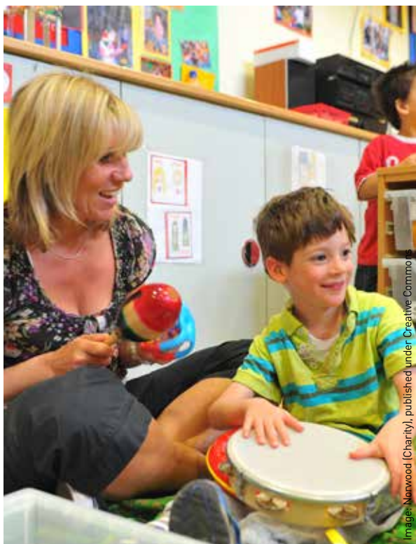
Returning to school, day care and pre-school routines assists with the restoration of social networks and supportive structures.

networks and supportive structures. It must be noted that such systems may first need to be re-established to be able to provide the required environment for positive recovery (Alisic 2012, Alisic et al. 2012, Baum et al. 2009). Supporting parents and communities to establish a 'trauma membrane' (see shaded box) for infants, children and young people is vital to restoring safety and promoting recovery for this group.