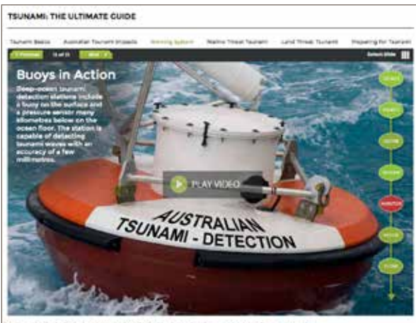
Produced by Burl Life Eaving Australia for ATAC - The Australian Tauneer Advisory Comp. More of

educates them about how to act during a tsunami. It provides nationally consistent messages ensuring Australians access warnings from the correct source during tsunami events.