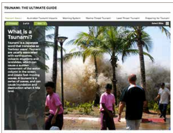
hoduced by Surf Life Saving Australia for ATAC - The Australian Taumant Advisory Croup. More in

There is a lot of information about tsunami available on the internet but there wasn't a single authoritative