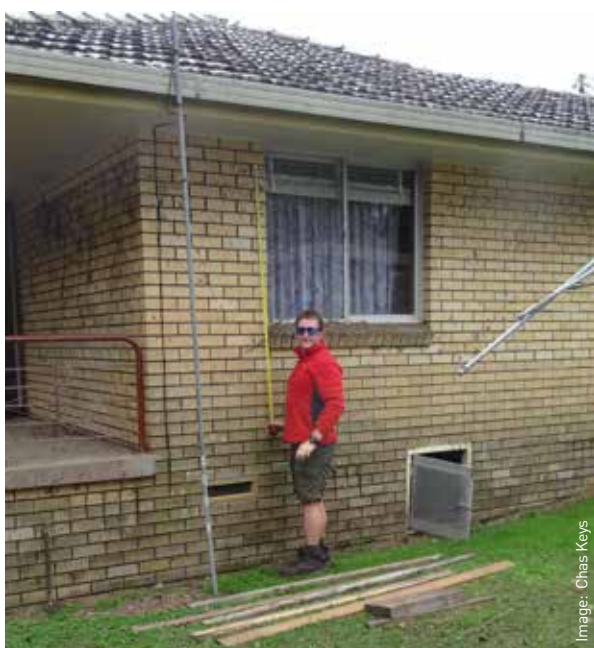
Many dwellings in Dungog were flooded to ceiling level, including these units in Brown Street.

The April 2015 flood in Dungog taught that whether because of the scale and speed of the event, split resources, inadequate numbers, leadership transitioning, local road closures and communications difficulties, emergency services organisations cannot be guaranteed to rescue everyone in need of rescue. Sustaining the capability of emergency services to respond well over the sometimes long periods between floods requires good plans, local ownership of those plans, scenario testing, organisational renewal, and smooth transitions in leadership.