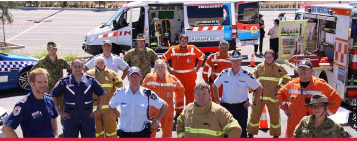
Volunteer organisations contribute significantly to community capacity in emergency management.