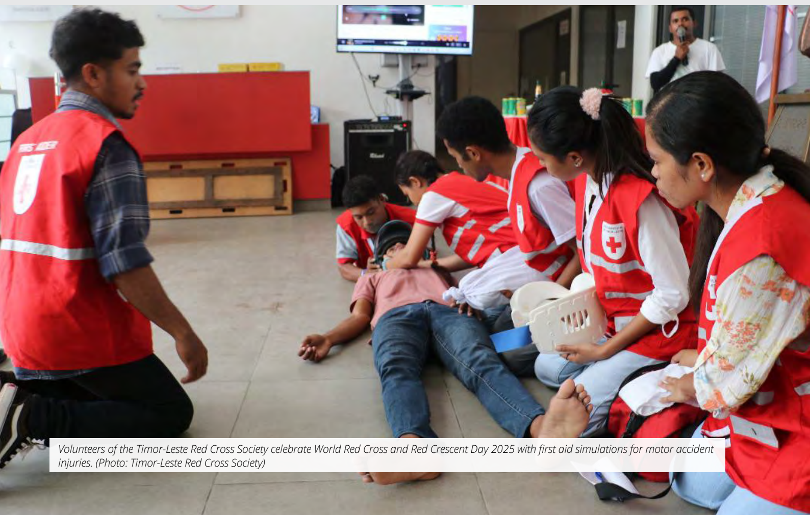
Volunteers of the Timor-Leste Red Cross Society celebrate World Red Cross and Red Crescent Day 2025 with first aid simulations for motor accident injuries.

World Bank Population below poverty line 42%