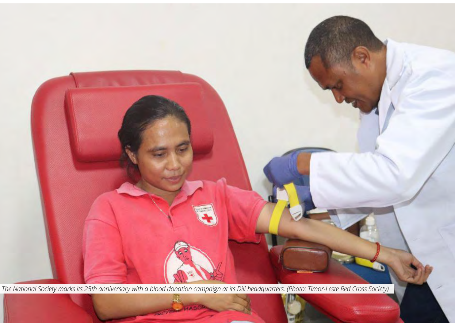
The National Society marks its 25th anniversary with a blood donation campaign at its Dili headquarters.

The Australian Red Cross will focus its support on strengthening capacity in Disaster Risk Management and Shelter. In disaster response, it will provide funding, technical assistance, logistics support, targeted deployments, regional surge operations and pilot flexible funding mechanisms.