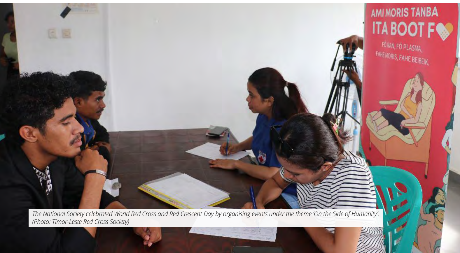
The National Society celebrated World Red Cross and Red Crescent Day by organising events under the theme 'On the Side of Humanity'.

The Australian Red Cross aims to strengthen the National Society as an inclusive, protective, and accountable humanitarian actor that delivers programmes and services responsive to the needs of at-risk groups. This partnership will focus on providing funding and technical support for implementing the Plan of Action on Protection, Gender and Inclusion, Safeguarding, and Child Protection assessments completed in 2025.