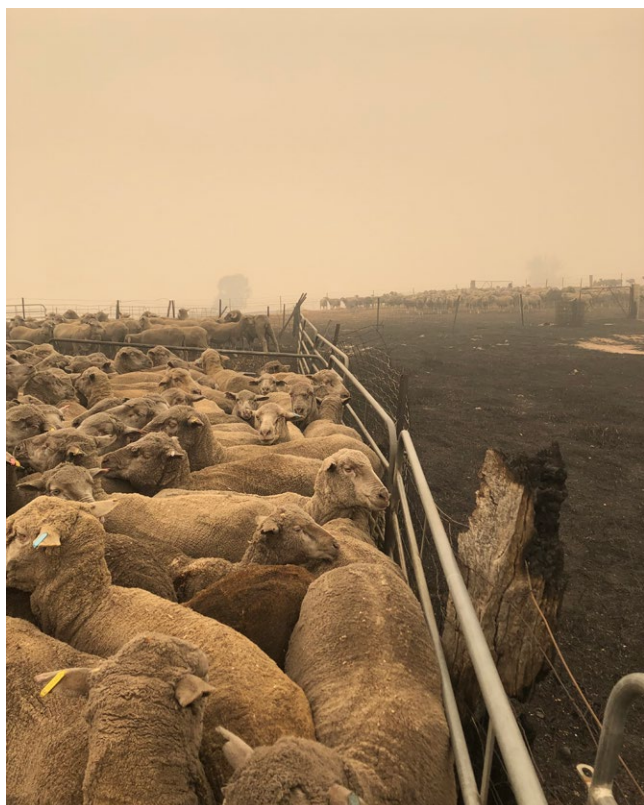
Sheep penned within a burnt area after bushfire require water and food.