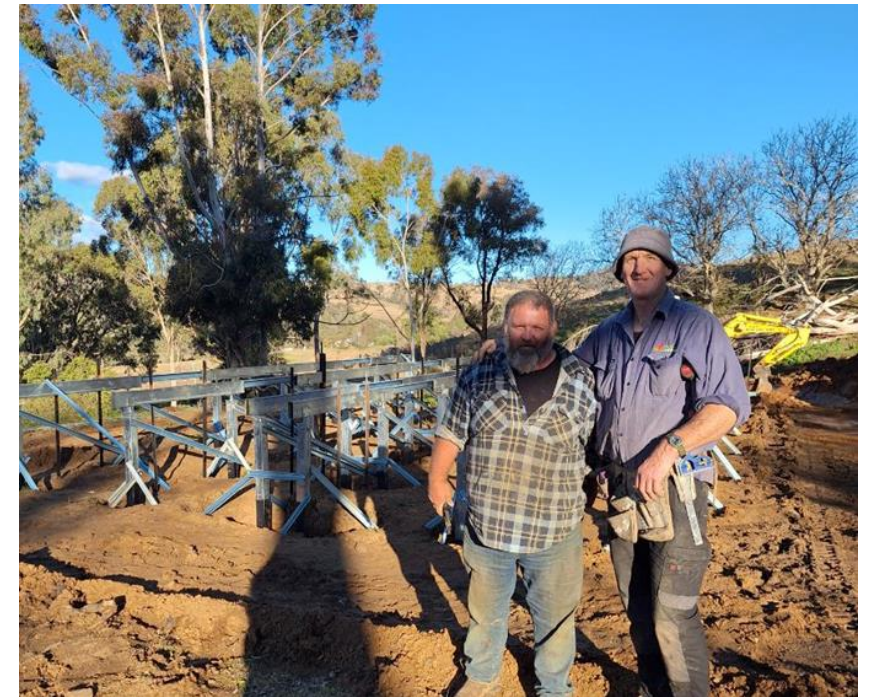
Rebuilding advisory service across three LGAs: Eurobodalla, Bega Valley & Snowy Valleys