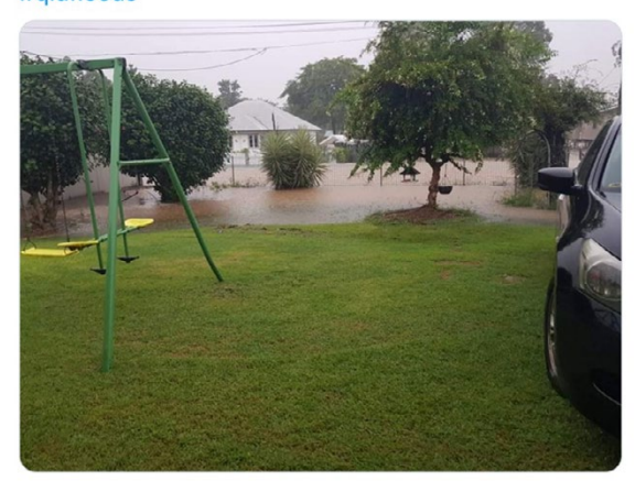
6:04 AM · Feb 26, 2022 · Twitter for Android