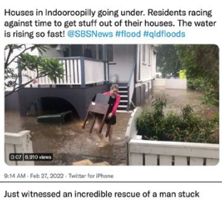
Just witnessed an incredible rescue of a man stuck under a pontoon at the Howard Smith Wharves ferry stop. Incredible bravery from everyone involved. #Brisbane #BNEfloods