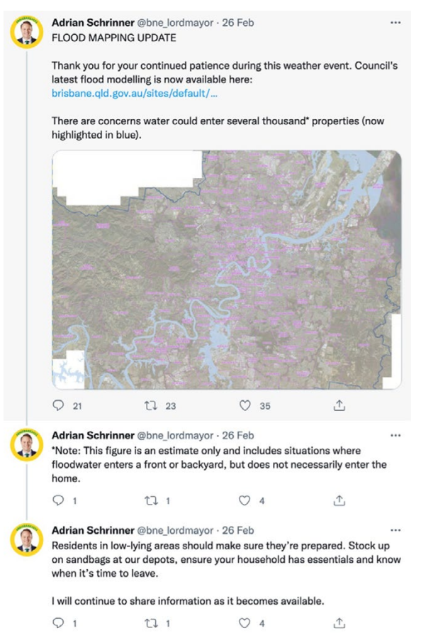
Figure 3: Tweets by Brisbane Lord Mayor Adrian Schrinner.

the Lord Mayor is significant as he had issued a tweet (Figure 3) that morning about the potential inundation of thousands of homes. This tweet is consistent with the rebuilding approach in that it provides information on what to expect, where to get help and evacuation advice. However, he used the bolstering approach at the media conference by reminding people to stay home as they did during the pandemic. He moved to the rebuild approach